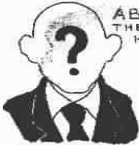
ABSENT ANDY THE SOLUTION: HEB 10:25