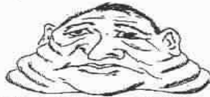
JELLYFISH JERRY THE SOLUTION: PSA 27:14