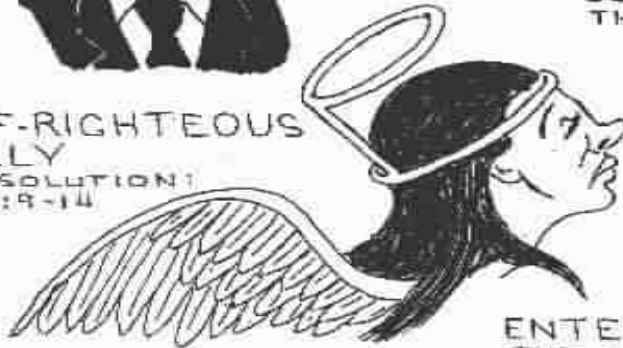
SELF-RIGHTEOUS SALLY THE SOLUTION: LK.18:9-14