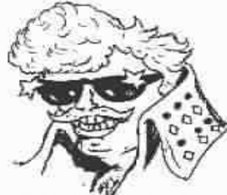
ENTERTAINING ED THE SOLUTION: JN.4:24